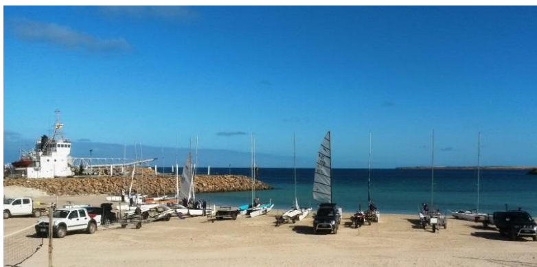
Sunday morning, Wallaroo SC beach.