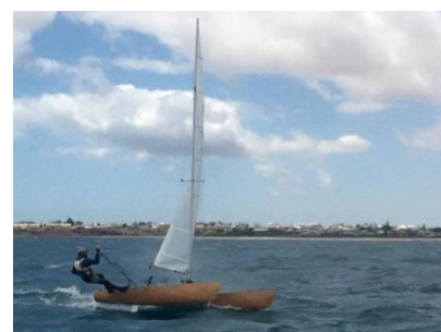
Aldebaran VI after Race 1: on the limit reaching into the beach. (Can't see his grin.)

But the official results told a different story!