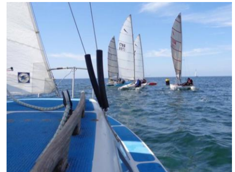
The mossie fleet congregates at the mark, Pt. Vincent YC