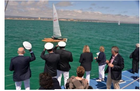
Aldebaran VI doffs his hat.

usual sail-past-the-officials course. Repeat laps until told to stop. What fun! Two mossies gave polite cheers to the commodore as they sailed past the official guests on catamaran Temptation .