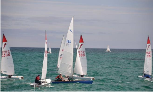
The Ancient Mariner weaves his way through the monos.

Adelaide: Opening day was a beautiful day to be on the water. The fleet had its